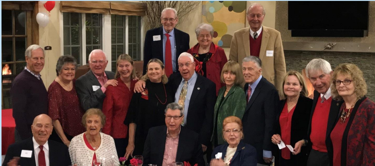
Here are some of the active members and couples of the Exchange Club of Newport Harbor posing for this Valentine's Day celebration

On February 14th the Exchange Club of Newport Harbor held its First Annual Valentine's Day Social. The guests enjoyed the swinging three-piece band, a fantastic hors d'oeuvres display and a dinner with everything at the level of perfection. Other Exchange Clubs joined to mingle and take part in the festive event. The photo shows some of the members and their spouses. The guests have enthusiastically asked that there be a "Second Annual" Social.